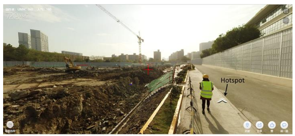
Figure 3.2 An Example of a Hotspot in the Virtual Environment

Students can view the 360 tour on different devices, but for the purposes of working collaboratively, Google Cardboard was chosen. With Google Cardboard, students simply open the relevant link on their smartphone, enter the VR view and then put the phone into the cardboard. The screen will split so that a stereoscopic view is presented and crosshairs will be presented in the view. When students wear the cardboard, they can aim the crosshairs at hotspots and after two seconds this will change the view from one scene to another. An example is presented in Figure 3.2.