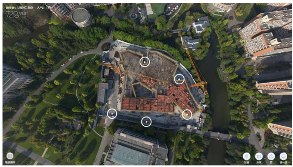
Figure 3.3. An Aerial View of the Construction Site.

Figure 3.3 shows an aerial view with five hotspot locations represented by the white circles. The user is able to travel to these locations by focusing the crosshairs on these spots for two seconds.