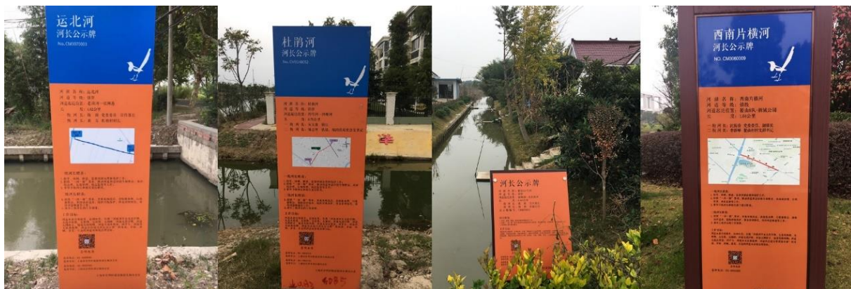
Figure 3. Billboards put up on the riverbank by the River Chief System Office of Chongming.