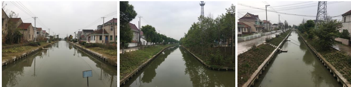
Figure 1. Riverbanks have been transformed during the river management on Chongming

to manage the environment (e.g. straightening rivers). On-site surveys enabled the authors to empathize with the resident’s concerns, as we observed the majority of the numerous rivers on Chongming had been cemented and elaborately-trimmed (Figure 1). During the longitudinal study, the authors also documented the transformation of a river alongside the Xinjiang Road before and after the riverbank construction (Figure 2). On November 14, 2017, as we came across this river that still maintains its natural state with wild plants by its banks, we found a truck laying down concrete columns by the road preparing for the river regulation project. Four months later, we revisited the river and found that the implementation of the project has totally transformed the landscape of the river. Concrete columns have been installed and typical riverside vegetation has been eradicated to be replaced by a managed, neat and manicured green. Alongside these visual changes will be the disappearance of the river’s original and natural ecology.