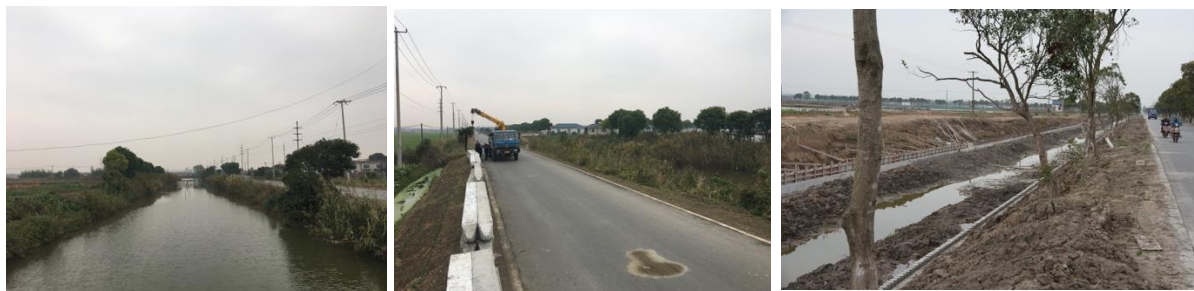
Figure 2. The transformation of Xinjiang Road River under the river project from 14-11-2017 to 29-03-2018.