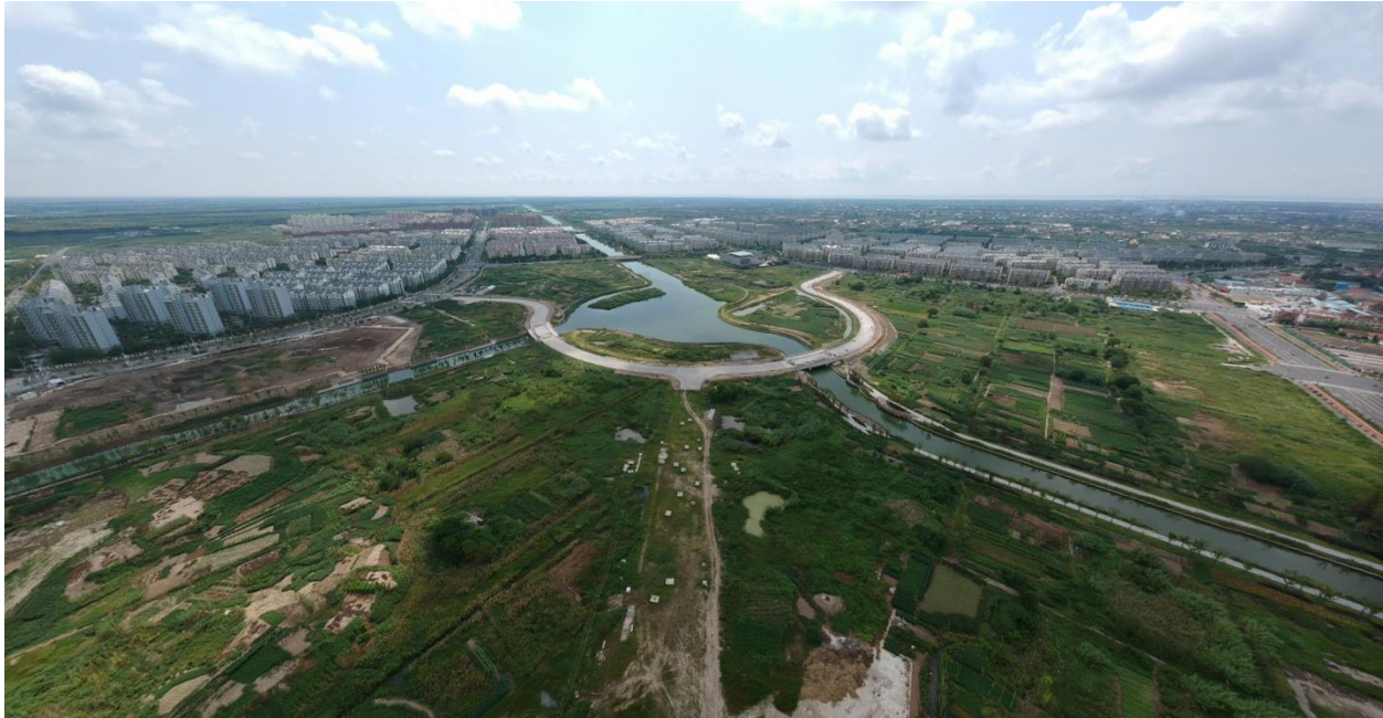
Figure 5. Wide open field at the site planned for International Forum Business District of Chenjia eco-town