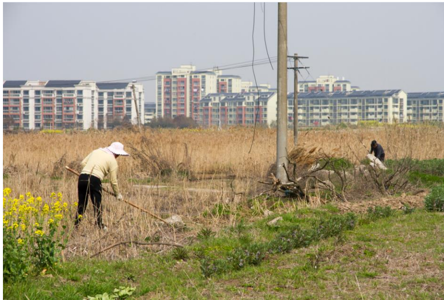
Figure 6. Residents in Chenjia Town cultivated temporarily idle construction land for growing vegetables

between the proposed industries – focusing on high-tech and data management– and the skills and knowledge of local residents (Cai, 2016). This could cause severe financial difficulties for local people and social stability concerns. Meanwhile, the environmental consequences also cannot be ignored. Relhousing of villagers takes them from their local environment with a consequent loss of their land management knowledge and practices, which will reduce the availability of an alternative expertise to challenge external, professional notions of a good environment (see above) so hastening further change.