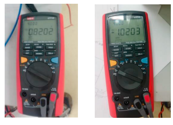
(a) Scratched MEA; (b) Commercial MEA