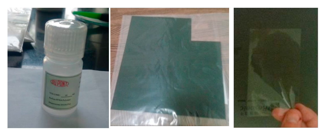
Fig. 2.Nafion 117 solution, GDL and Nafion 115 membrane

One can paint it for several times and dry it after painting, make the total mass of catalyst transferred to the plate is at least 0.2g/cm<sup>2</sup>.