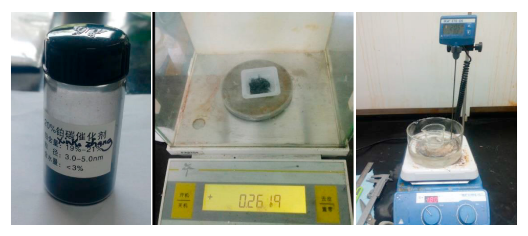
Fig. 1. Pt/C (20%Pt) catalyst, electronic balance, water bath and magnetic stirrer

• Two pieces of Teflon transfer plate 10cm*4cm: The transfer plate is used to transfer catalyst from the plate to the processed Nafion 115 membrane.