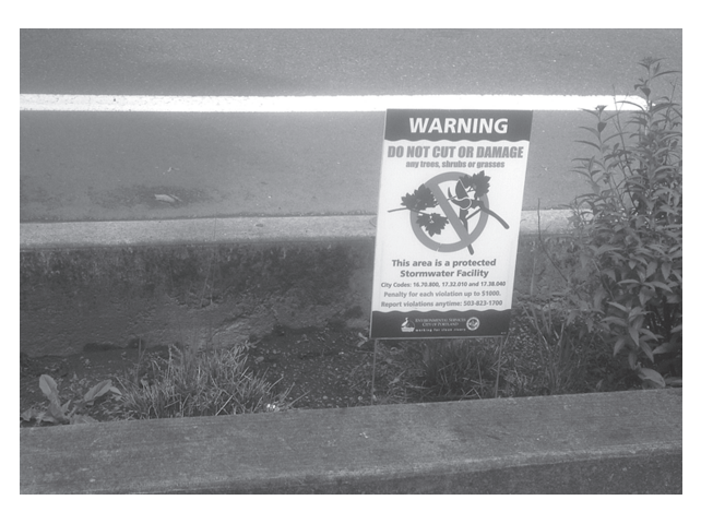
Figure 5 Incomplete bioswale with Bureau of Environmental Services sign warning against interference.

The city does have a volunteer Green Streets Stewards (GSS) programme, training people to know which plants should be in the bioswales and to trim and weed them (BES, 2012, 2013). Whilst they do not want untrained residents weeding (see Figure 5), they encourage people to clear out trash and debris to improve functionality (BES, 2012).