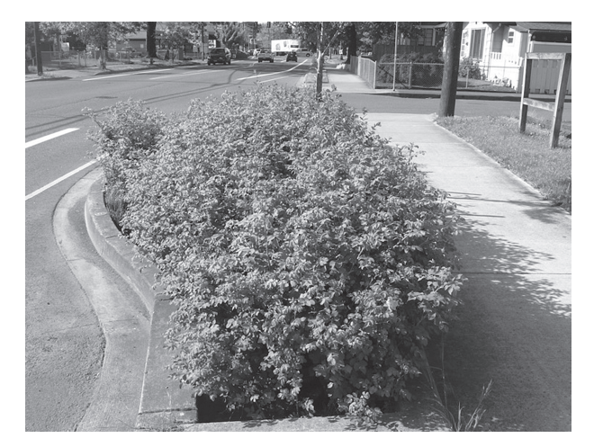
Figure 3 Bioswale extending into the road.

This is significant, since positive shifts in opinion seemed possible when the purpose and function of the devices was explained, face-to-face, in lay terms: