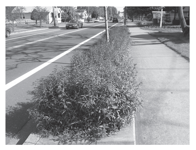
Figure 4 Bioswale not extending into the road.

'It occupies a traffic lane which is also a parking lane. So it's taking away traffic when it's designated to drive and parking in the evening. These are residential-