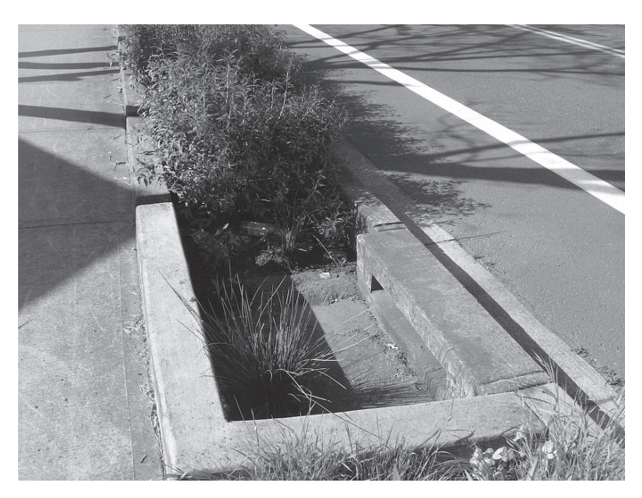
Figure 1 Incomplete bioswale showing water inlets.

scoring for sustainability efforts in Portney's (2013) review of US cities (see also Mayer and Provo, 2004).